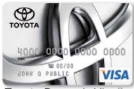
Toyota Rewards Visa®

Toyota helps you get more out of every dollar you spend. By rewarding you for every purchase you make, the Toyota Rewards Visa® adds even more value to doing the things you love.