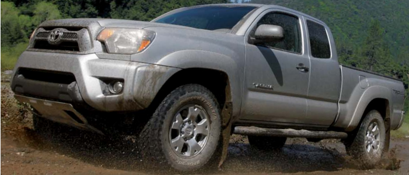
4x4 Access Cab V6 shown in Silver Streak Mica with available TRD Off-Road Package, accessory front skid plate and black tube steps.

Watch out for this one. The 2013 Toyota Tacoma is clearly looking to start something. Like an ATV weekend in the mountains. Or an off-roading trip to the desert. But there's more to this truck than its aggressive new front end. Tacoma is built to finish what it starts. It's forged on massive one-piece frame rails with eight sturdy cross members and a fully boxed front sub-frame. It's got a rugged fiber-reinforced Sheet-Molded Composite (SMC) bed that provides better impact strength than steel. Plus, a leaf spring suspension with staggered outboard-mounted gas shocks. And an available V6 engine with Variable Valve Timing with intelligence (VVT-i) that delivers maximum power on minimum fuel. If you still want to up the ante, it's also got a truckload of extras to choose from: an available TRD Off-Road Package with Bilstein® shocks, 16-in. alloy wheels with P265/70R16 BFGoodrich® tires, Hill Start Assist Control (HAC), 1 Downhill Assist Control (DAC) 2 and an electronically controlled locking rear differential. So, a word to the wise: Try to stay on Tacoma's good side. Get behind the wheel. The 2013 Toyota Tacoma.