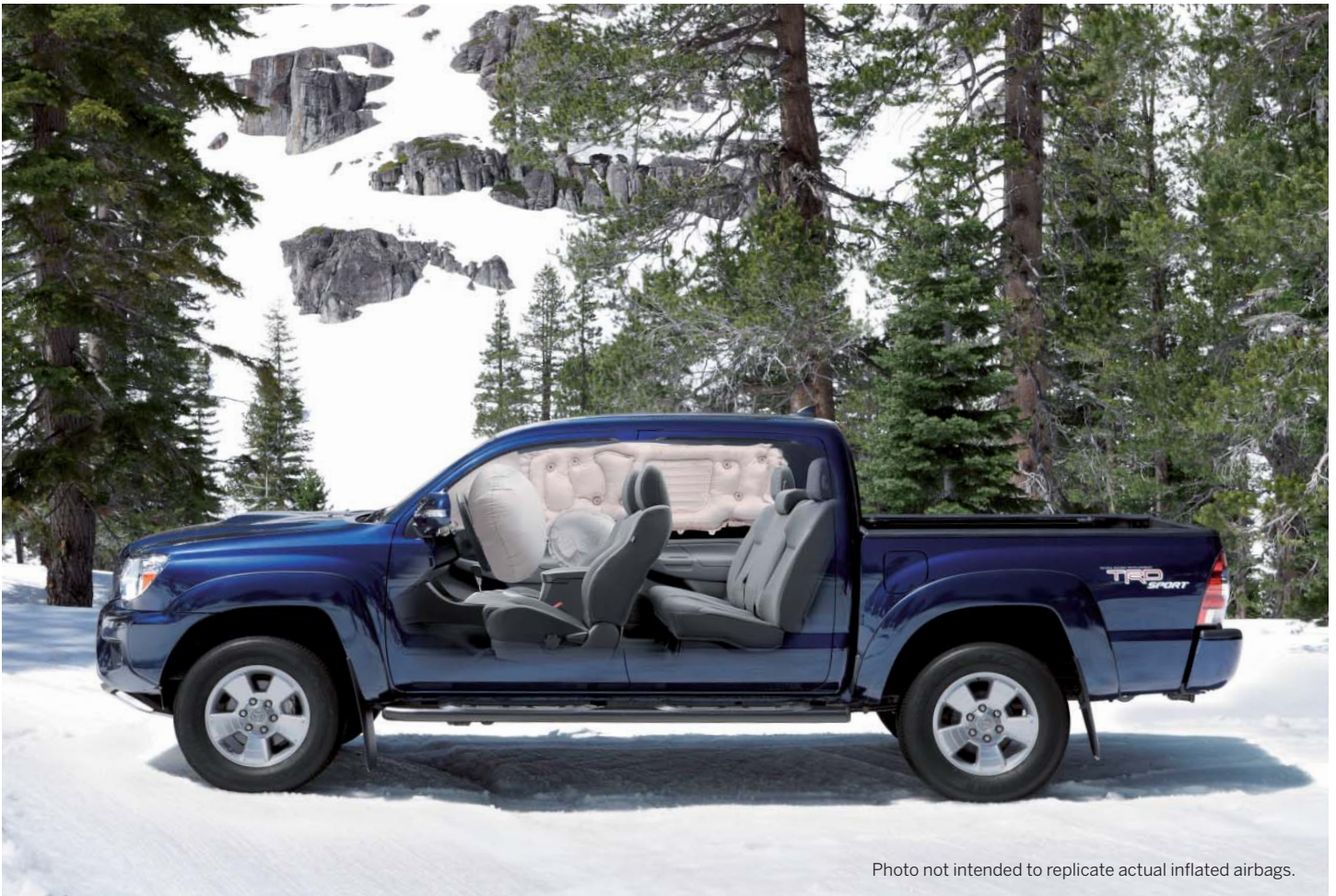
Photo not intended to replicate actual inflated airbags.