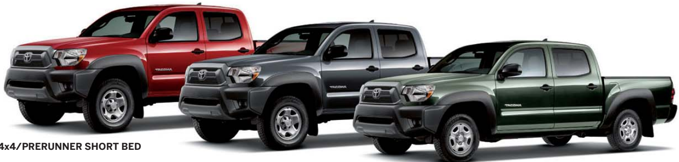
4x4/PRERUNNER SHORT BED