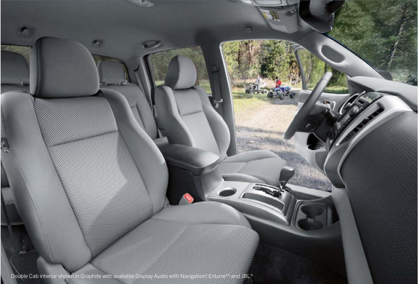
2 DOUBLE CAB FOLD-DOWN REAR SEATBACK

Double Cab interior shown in Graphite with available Display Audio with Navigation 1 , Entune 2 and JBL. ®